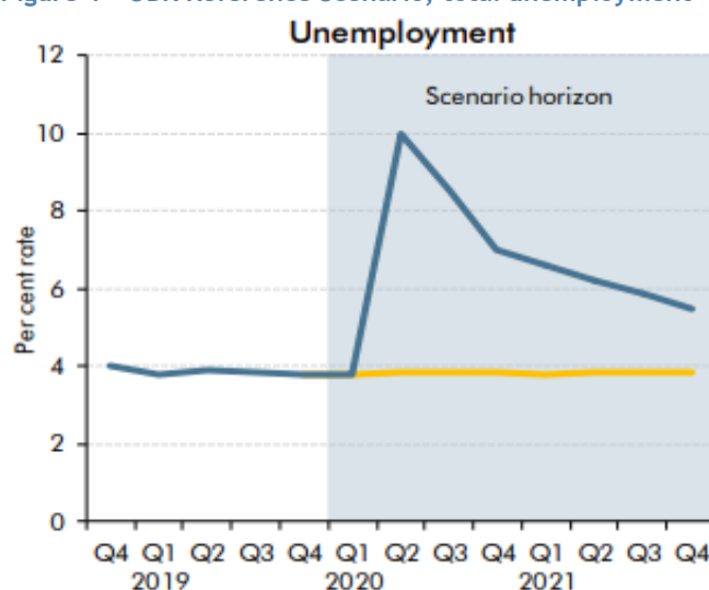
Figure 1 - OBR Reference Scenario, total unemployment